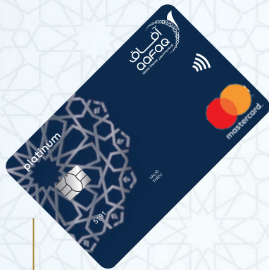
Aafaq Platinum Credit Card