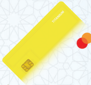
Aafaq Titanium Credit Card