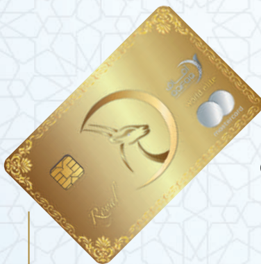
Royal world Elite Card