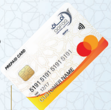
Aafaq Prepaid Card