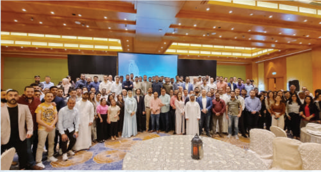
◀ Aafaq Islamic Finance held annual Iftar gathering for staff.