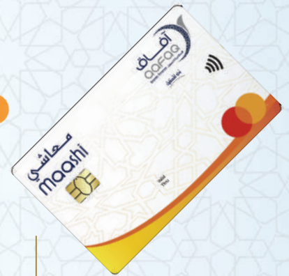
Maashi WPS Card