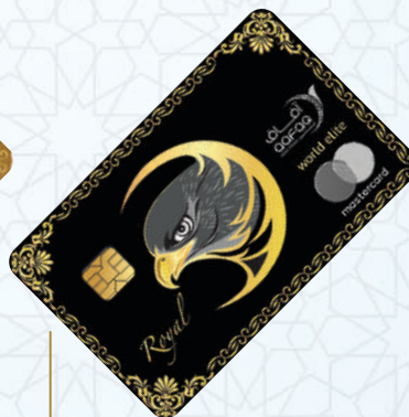
Royal world Elite Card