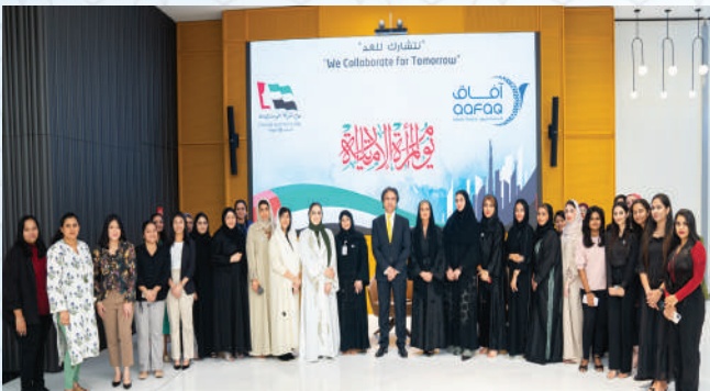
◀ Honoring the strength, resilience, and achievements of Emirati women who inspire us every day at Aafaq Islamic Finance.

Aafaq Islamic Finance investing in our people, helping them grow into the leaders of tomorrow. Aafaq staffs graduated from PwC academy